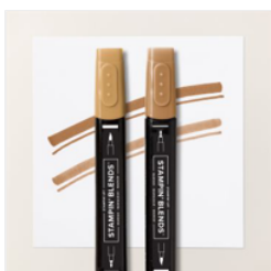
Pecan Pie Stampin' Blends Combo Pack - 161674