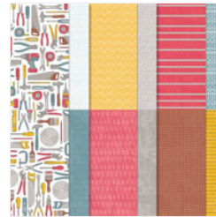
Trusty Toolbox 12" X 12" (30.5 X 30.5 Cm) Designer Series Paper - 162978