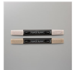
Crumb Cake Stampin' Blends Combo Pack - 154882