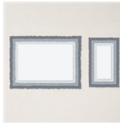
Deckled Rectangles Dies - 159173