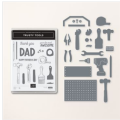
Trusty Tools Bundle (English) - 162723