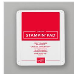
Poppy Parade Classic Stampin' Pad - 147050