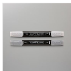
Smoky Slate Stampin' Blends Combo Pack - 154904