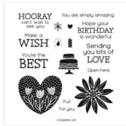
Hooray For Surprises Photopolymer Stamp Set (English) - 162851