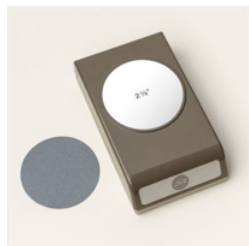
2-3/8" (6 Cm) Circle Punch - 161354