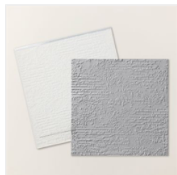
Exposed Brick 3D Embossing Folder - 161600