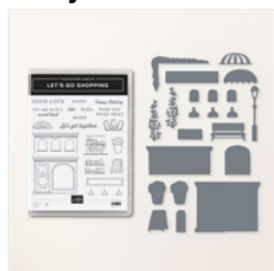
Let's Go Shopping Bundle (English) - 161333