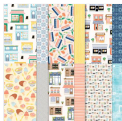
Les Shoppes 12" X 12" (30.5 X 30.5 Cm) Designer Series Paper - 161322