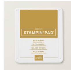
Wild Wheat Classic Stampin' Pad - 161651