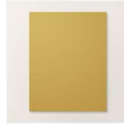
Wild Wheat 8-1/2" X 11" Cardstock - 161725