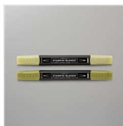
Old Olive Stampin' Blends Combo Pack - 154892