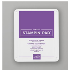
Gorgeous Grape Classic Stampin' Pad - 147099