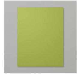
Old Olive 8-1/2" X 11" Cardstock - 100702