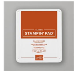
Cajun Craze Classic Stampin' Pad - 147085