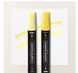
Lemon Lolly Stampin' Blends Combo Pack - 161673