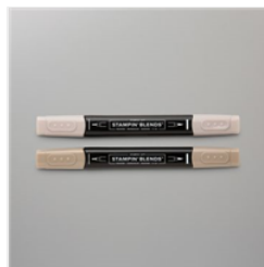
Crumb Cake Stampin' Blends Combo Pack - 154882