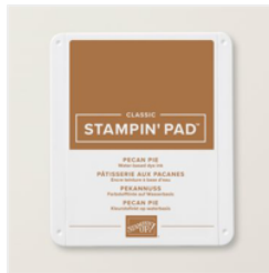
Pecan Pie Classic Stampin' Pad - 161665