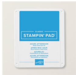
Azure Afternoon Classic Stampin' Pad - 161663