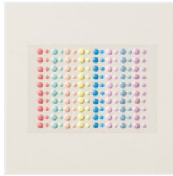
Rainbow Adhesive-Backed Dots - 162758