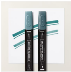
Pretty Peacock Stampin' Blends Combo Pack - 161676