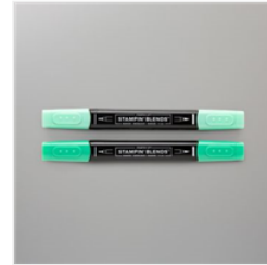
Shaded Spruce Stampin' Blends Combo Pack - 154903