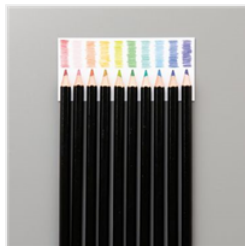
Watercolor Pencils Assortment 2 - 149014