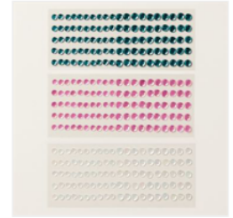
Adhesive-Backed Sequins Trio - 161206