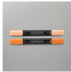
Pumpkin Pie Stampin' Blends Combo Pack - 154897