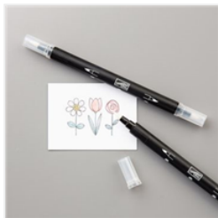
Blender Pens - 102845