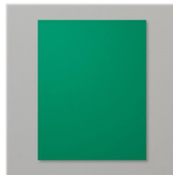
Shaded Spruce 8-1/2" X 11" Cardstock - 146981