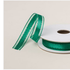
Shaded Spruce 1/2" (1.3 Cm) Satin & Sheer Ribbon - 164224