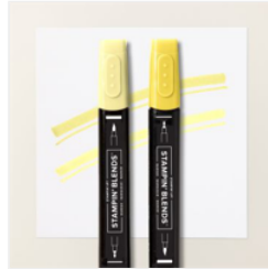
Lemon Lolly Stampin' Blends Combo Pack - 161673