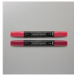
Cherry Cobbler Stampin' Blends Combo Pack - 154880