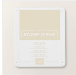
Basic Beige Classic Stampin' Pad - 163806