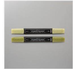
Old Olive Stampin' Blends Combo Pack - 154892