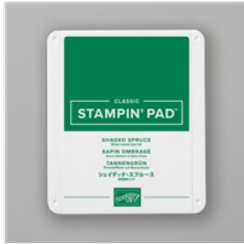
Shaded Spruce Classic Stampin' Pad - 147088

inkybeestampers@gmail.com https://www.inkybeestampers.com