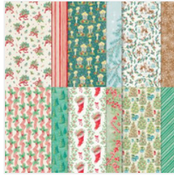
Sentimental Christmas 12" X 12" (30.5 X 30.5 Cm) Designer Series Paper - 164209