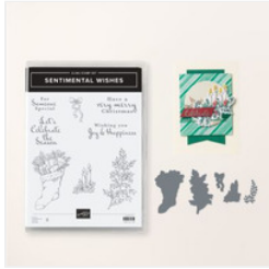
Sentimental Wishes Bundle (English) - 164220

inkybeestampers@gmail.com https://www.inkybeestampers.com