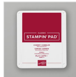
Cherry Cobbler Classic Stampin' Pad - 147083