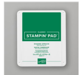
Shaded Spruce Classic Stampin' Pad - 147088