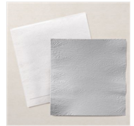
Timber 3D Embossing Folder - 156406