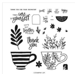
Cup Of Tea Photopolymer Stamp Set (English) - 158661