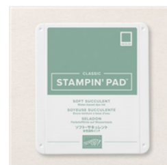
Soft Succulent Classic Stampin' Pad - 155778