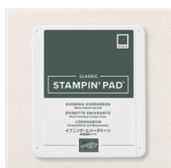
Evening Evergreen Classic Stampin' Pad - 155576