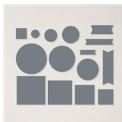
Stylish Shapes Dies - 159183