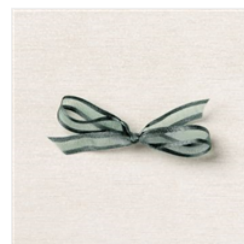
Evening Evergreen 3/8" (1 Cm) Open Weave Ribbon - 155573