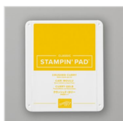
Crushed Curry Classic Stampin' Pad - 147087