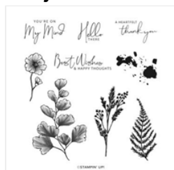
Nature's Prints Cling Stamp Set (English) - 158793