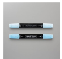
Balmy Blue Stampin' Blends Combo Pack - 154830