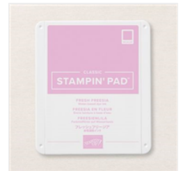
Fresh Freesia Classic Stampin' Pad - 155611