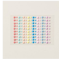
Rainbow Adhesive-Backed Dots - 162758