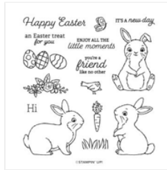
Easter Bunny Photopolymer Stamp Set (English) - 160272