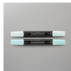
Pool Party Stampin' Blends Combo Pack - 154894