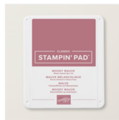
Moody Mauve Classic Stampin' Pad - 161649