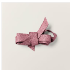
Moody Mauve 3/8" (1 Cm) Textured Ribbon - 161630