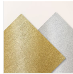
Silver & Gold 12" X 12" (30.5 X 30.5 Cm) Adhesive- Backed Glimmer Paper - 162288