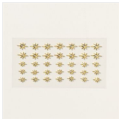
Adhesive-Backed Star Trinkets - 162010