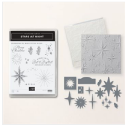
Stars At Night Bundle (English) - 162007