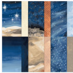
O Holy Night 12" X 12" (30.5 X 30.5 Cm) Designer Series Paper - 161986