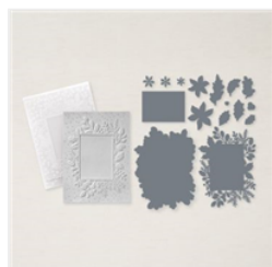
Merriest Frames Hybrid Embossing Folder - 156385