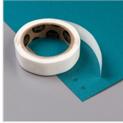
Mini Glue Dots - 103683