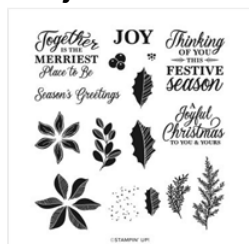
Merriest Moments Photopolymer Stamp Set (English) - 156353