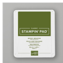
Mossy Meadow Classic Stampin' Pad - 147111