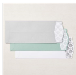
Slimline Envelopes - 157981