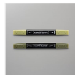
Mossy Meadow Stampin' Blends Combo Pack - 154890