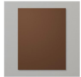
Early Espresso 8-1/2" X 11" Cardstock - 119686