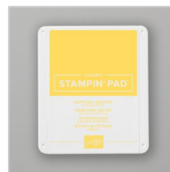
Daffodil Delight Classic Stampin' Pad - 147094