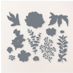
Textured Floral Dies - 161231

inkybeestampers@gmail.com https://www.inkybeestampers.com