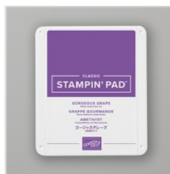
Gorgeous Grape Classic Stampin' Pad - 147099