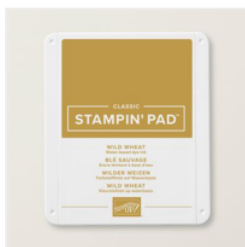
Wild Wheat Classic Stampin' Pad - 161651