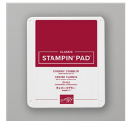
Cherry Cobbler Classic Stampin' Pad - 147083