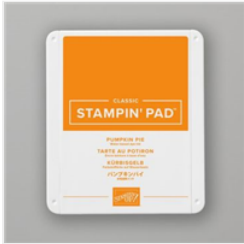
Pumpkin Pie Classic Stampin' Pad - 147086

inkybeestampers@gmail.com https://www.inkybeestampers.com