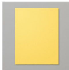
Daffodil Delight 8-1/2" X 11" Cardstock - 119683