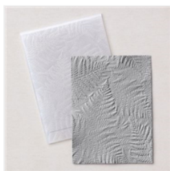
Fern 3D Embossing Folder - 158804