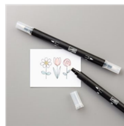
Blender Pens - 102845