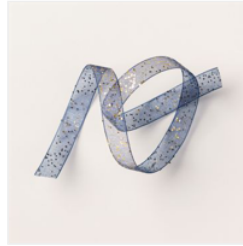
Night Of Navy & Gold 1/2" (1.3 Cm) Glittered Ribbon - 162011