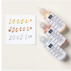
Metallic Enamel Effects Basics - 161610