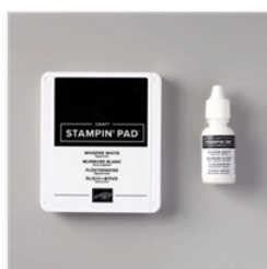
Unlinked Stampin' Pad & Whisper White Refill - 147277