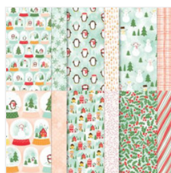
Snowy Scenes 12" X 12" (30.5 X 30.5 Cm) Designer Series Paper - 164333