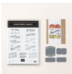
Christmas Labels Bundle (English) - 164101