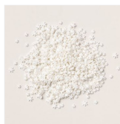
White Loose Snowflakes - 164128