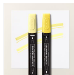
Lemon Lolly Stampin' Blends Combo Pack - 161673