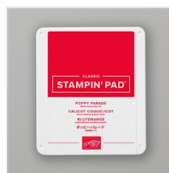
Poppy Parade Classic Stampin' Pad - 147050