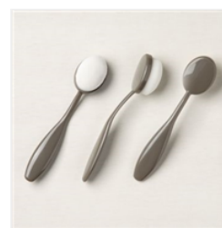
Blending Brushes - 153611