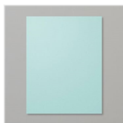
Pool Party 8-1/2" X 11" Cardstock - 122924