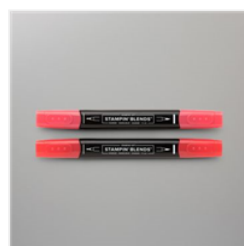
Poppy Parade Stampin' Blends Combo Pack - 154958