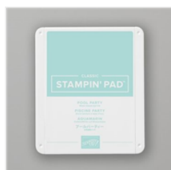
Pool Party Classic Stampin' Pad - 147107