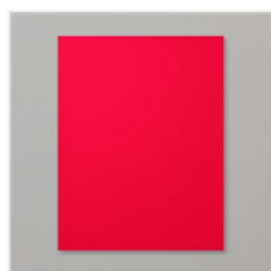
Poppy Parade 8-1/2" X 11" Cardstock - 119793