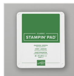
Garden Green Classic Stampin' Pad - 147089