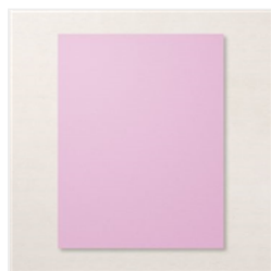
Fresh Freesia 8-1/2" X 11" Cardstock - 155613