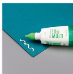
Multipurpose Liquid Glue - 110755