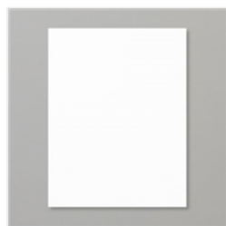
Basic White 8-1/2" X 11" Cardstock - 159276