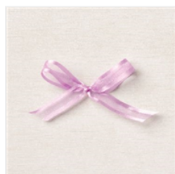
Fresh Freesia 3/8" (1 Cm) Open Weave Ribbon - 155615