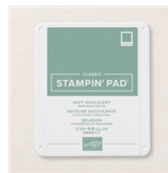
Soft Succulent Classic Stampin' Pad - 155778