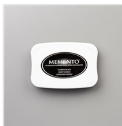
Tuxedo Black Memento Ink Pad - 132708