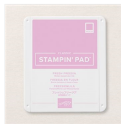
Fresh Freesia Classic Stampin' Pad - 155611