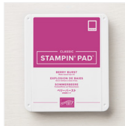
Berry Burst Classic Stampin' Pad - 147143