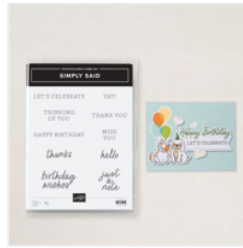
Simply Said Mix & Match Photopolymer Stamp Set (English) - 163756