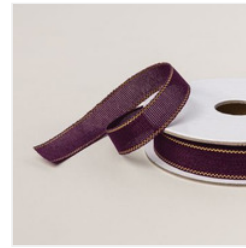
Blackberry Bliss & Gold 1/2" (1.3 Cm) Textured Ribbon - 164039