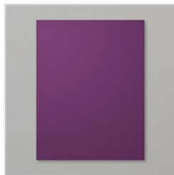
Blackberry Bliss 8-1/2" X 11" Cardstock - 133675