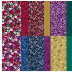
Regal Winter 12" X 12" (30.5 X 30.5 Cm) Designer Series Paper - 164156