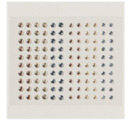
Adhesive-Backed Metallic Gems - 163780