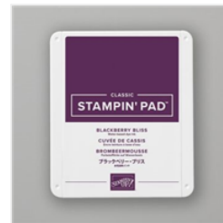
Blackberry Bliss Classic Stampin' Pad - 147092