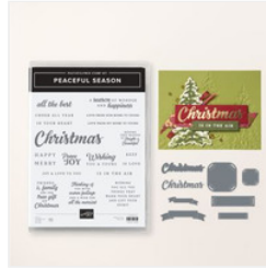
Peaceful Season Bundle (English) - 164021