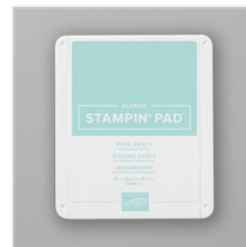
Pool Party Classic Stampin' Pad - 147107