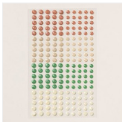
Earth Tones Shimmer Gems - 164070