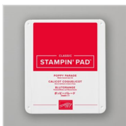
Poppy Parade Classic Stampin' Pad - 147050