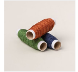
Natural Tones Linen Thread - 164071