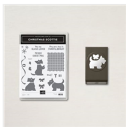
Christmas Scottie Bundle (English) - 159744