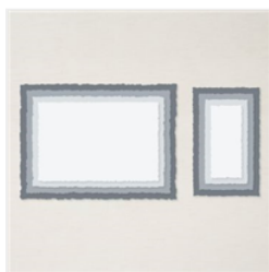
Deckled Rectangles Dies - 159173