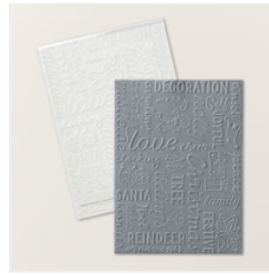
Christmas Tidings Embossing Folder - 162115