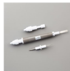
Take Your Pick - 144107