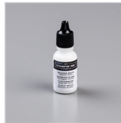
Whisper White Craft Stampin' Ink Refill - 101780