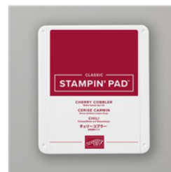
Cherry Cobbler Classic Stampin' Pad - 147083