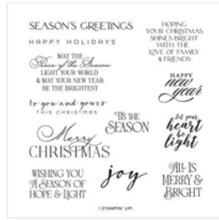
Brightest Glow Cling Stamp Set (English) - 159542