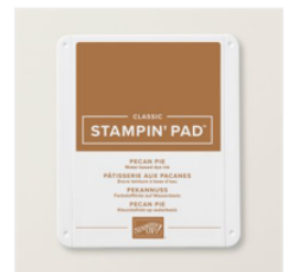
Pecan Pie Classic Stampin' Pad - 161665