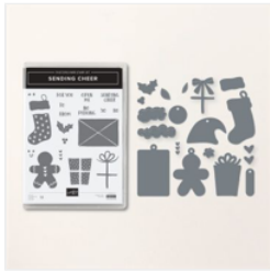
Sending Cheer Bundle (English) - 162053