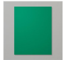
Shaded Spruce 8- 1/2" X 11" Cardstock - 146981