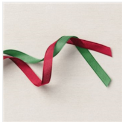
Real Red & Garden Green 3/8" (1 Cm) Ribbon Combo Pack - 159577