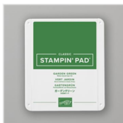
Garden Green Classic Stampin' Pad - 147089