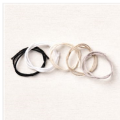
Baker's Twine Essentials Pack - 155475