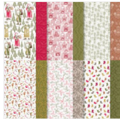
Traditions Of St. Nick 12" X 12" (30.5 X 30.5 Cm) Designer Series Paper - 162355