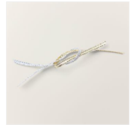
Gold & Silver 1/8" (3.2 Mm) Trim Combo Pack - 161633