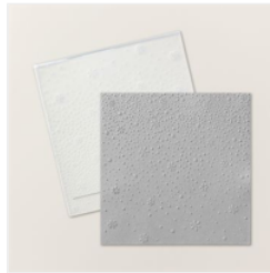
Snowflake Sky 3D Embossing Folder - 162026