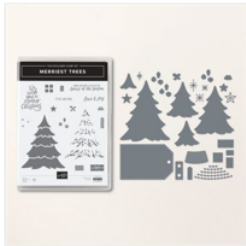
Merriest Trees Bundle (English) - 162048