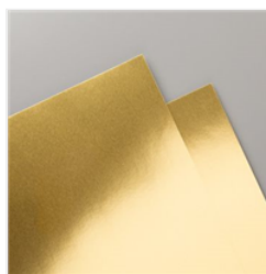
Gold Foil Sheets - 132622