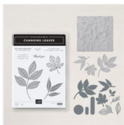
Changing Leaves Bundle (English) - 164139