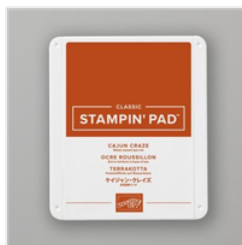
Cajun Craze Classic Stampin' Pad - 147085