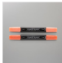
Cajun Craze Stampin' Blends Combo Pack - 154879