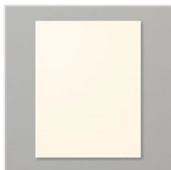
Very Vanilla 8-1/2" X 11" Cardstock - 101650