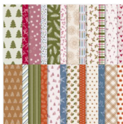
Iconic Celebrations 6" X 6" (15.2 X 15.2 Cm) Designer Series Paper - 164193