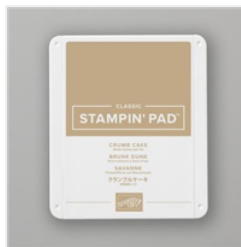
Crumb Cake Classic Stampin' Pad - 147116