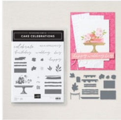
Cake Celebrations Bundle (English) - 164875

inkybeestampers@gmail.com https://www.inkybeestampers.com