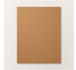
Pecan Pie 8-1/2" X 11" Cardstock - 161717