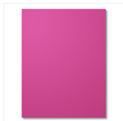
Berry Burst 8-1/2" X 11" Cardstock - 144243