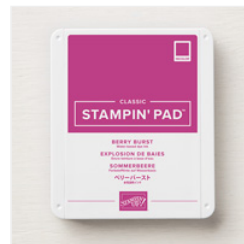
Berry Burst Classic Stampin' Pad - 147143