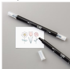
Blender Pens - 102845

inkybeestampers@gmail.com https://www.inkybeestampers.com