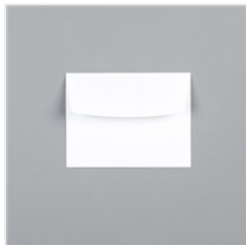
Basic White Medium Envelopes - 159236