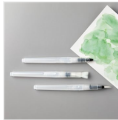
Water Painters - 151298