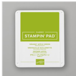
Granny Apple Green Classic Stampin' Pad - 147095