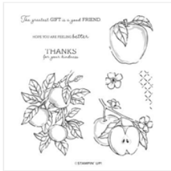
Apple Harvest Cling Stamp Set (English) - 159944

inkybeestampers@gmail.com https://www.inkybeestampers.com