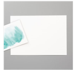
Fluid 100 Watercolor Paper - 149612