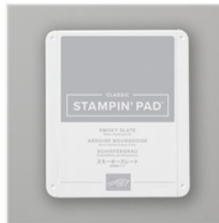
Smoky Slate Classic Stampin' Pad - 147113