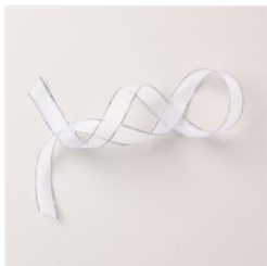
Silver & White 1/2" (1.3 Cm) Sheer Ribbon - 162149