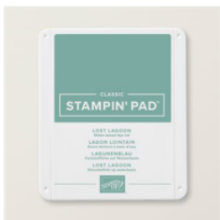
Lost Lagoon Classic Stampin' Pad - 161678