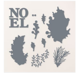
Joy Of Noel Dies - 161965