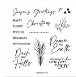
Christmas Classics Photopolymer Stamp Set (English) - 161970