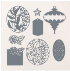
Handcrafted Elements Dies - 162330