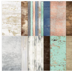
Country Woods 12" X 12" (30.5 X 30.5 Cm) Designer Series Paper - 163393