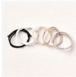
Baker's Twine Essentials Pack - 155475