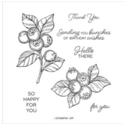
Blueberry Bunches Cling Stamp Set (English) - 162692