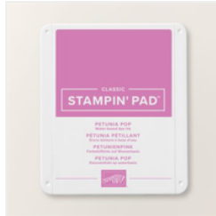
Petunia Pop Classic Stampin Pad - 163811