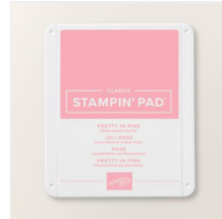
Pretty In Pink Classic Stampin Pad - 163807