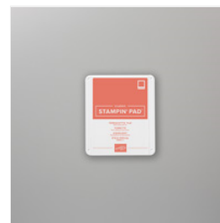
Terracotta Tile Classic Stampin' Pad - 150086