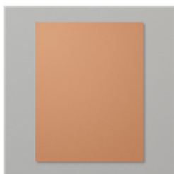
Cinnamon Cider 8-1/2 X 11 Cardstock - 153078