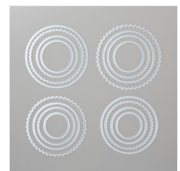
Layering Circles Dies - 151770