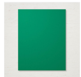
Shaded Spruce 8-1/2 X 11 Cardstock - 146981