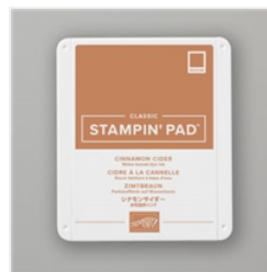
Cinnamon Cider Classic Stampin' Pad - 153114