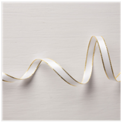
Gold 3/8" (1 Cm) Metallic Edge Ribbon - 144146

candy@sweetstamper.com http://sweetstamper.com