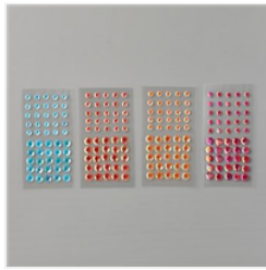
Artistry Blooms Adhesive-Backed Sequins - 152477