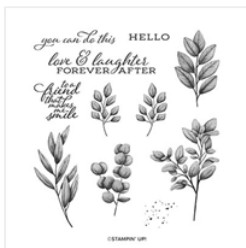
Forever Fern Cling Stamp Set (En) - 152559