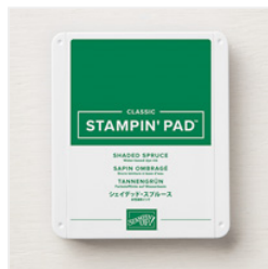
Shaded Spruce Classic Stampin' Pad - 147088