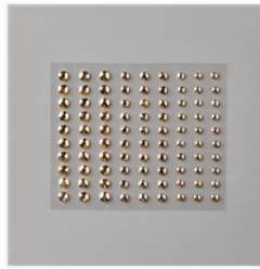
Gilded Gems - 152478