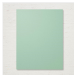
Mint Macaron 8-1/2 X 11 Cardstock - 138337