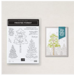
Frosted Forest Photopolymer Stamp Set (English) - 164344

candy@sweetstamper.com http://sweetstamper.com