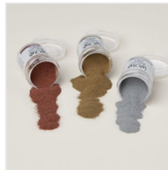
Metallics Wow! Embossing Powder - 165678