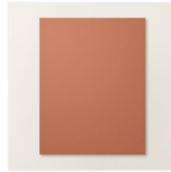
Copper Clay 8-1/2" X 11" Cardstock - 161721