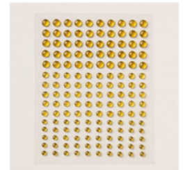
Gold Textured Adhesive-Backed Dots - 164027