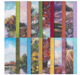
Splendid Autumn 6" X 6" (15.2 X 15.2 Cm) Designer Series Paper - 164173