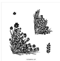
Corner Bouquet Cling Stamp Set - 155273