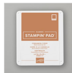
Cinnamon Cider Classic Stampin' Pad - 153114