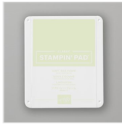
Soft Sea Foam Classic Stampin' Pad - 147102