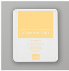
So Saffron Classic Stampin' Pad - 147109

candy@sweetstamper.com http://sweetstamper.com