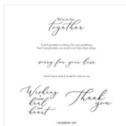
Heal Your Heart Cling Stamp Set (English) - 155291