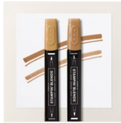
Pecan Pie Stampin' Blends Combo Pack - 161674