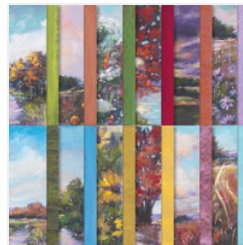
Splendid Autumn 6" X 6" (15.2 X 15.2 Cm) Designer Series Paper - 164173