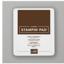
Early Espresso Classic Stampin' Pad - 147114