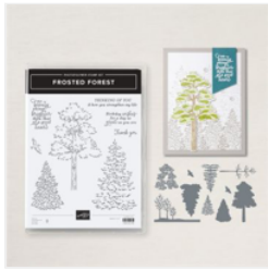
Frosted Forest Bundle (English) - 164137

candy@sweetstamper.com http://sweetstamper.com