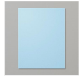
Balmy Blue 8-1/2" X 11" Cardstock - 146982