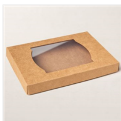
Kraft Gift Boxes - 156569