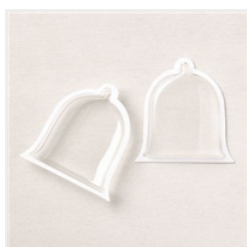
Cloche Shaker Domes - 156387