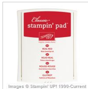
Real Red Classic Stampin' Pad