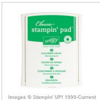
Cucumber Crush Classic Stampin' Pad