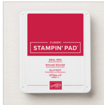
Real Red Classic Stampin' Pad