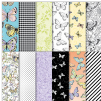
Botanical Butterfly Designer Series