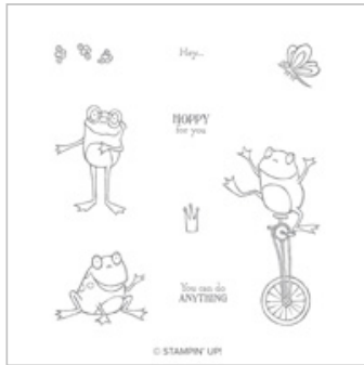
So Hoppy Together Cling Stamp Set