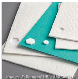
Mini Stampin' Dimensionals