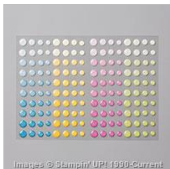
Glitter Enamel Dots