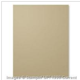
Crumb Cake 8-1/2" X 11" Cardstock