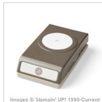
2" (5.1 Cm) Circle Punch