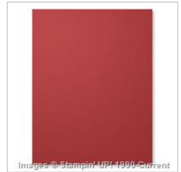
Cherry Cobbler 8-1/2" X 11" Cardstock