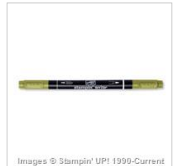
Old Olive Stampin' Write Marker