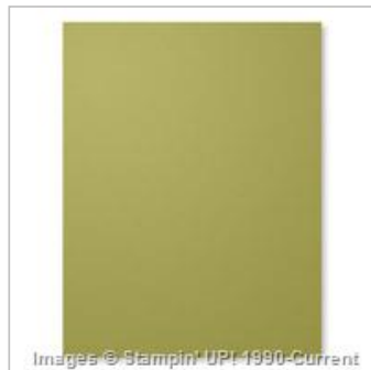
Old Olive 8-1/2" X 11" Cardstock