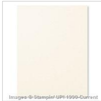
Very Vanilla 8-1/2" X 11" Cardstock