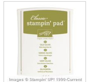
Old Olive Classic Stampin' Pad