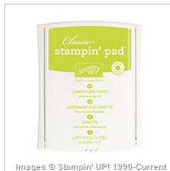
Lemon Lime Twist Classic Stampin' Pad