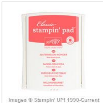
Watermelon Wonder Classic Stampin' Pad