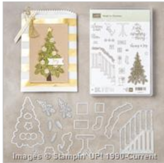
Ready For Christmas Photopolymer Bundle