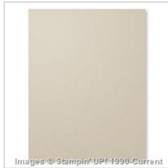
Sahara Sand 8-1/2" X 11" Cardstock