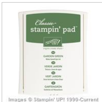
Garden Green Classic Stampin' Pad