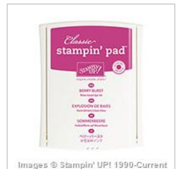
Berry Burst Classic Stampin' Pad