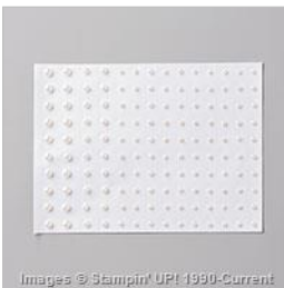
Pearl Basic Jewels - 144219