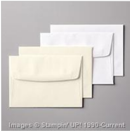
Very Vanilla Note Cards & Envelopes - 144236