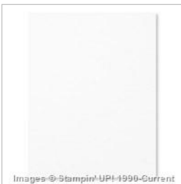
Whisper White 8-1/2" X 11" Cardstock - 100730