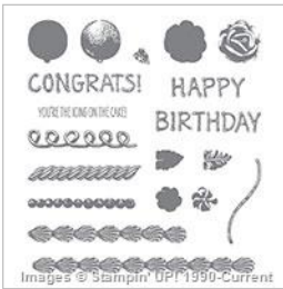
Icing On The Cake Photopolymer Stamp Set - 143664