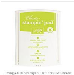
Lemon Lime Twist Classic Stampin' Pad - 144086