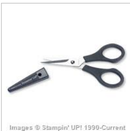
Paper Snips - 103579