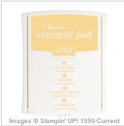
So Saffron Classic Stampin' Pad - 126957