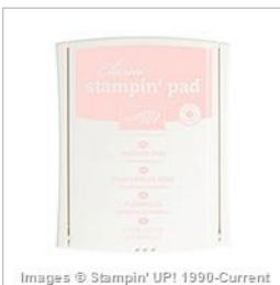
Powder Pink Classic Stampin' Pad - 144084