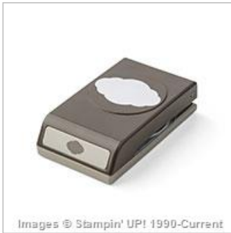
Pretty Label Punch