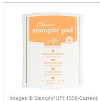
Peekaboo Peach Classic Stampin' Pad