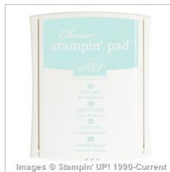
Soft Sky Classic Stampin' Pad