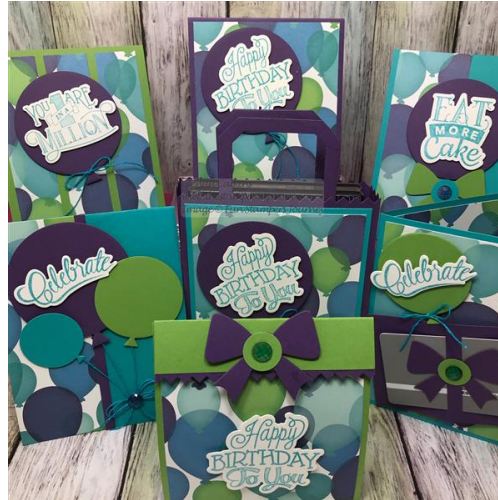
Celebration Script Bundle Card Carrier + 4 cards + 1 gift card/card Treat Holder/Gift Card Holder

www.funstampersjourney.com/Pws/GlendaCalkins/store/AM/default.aspx