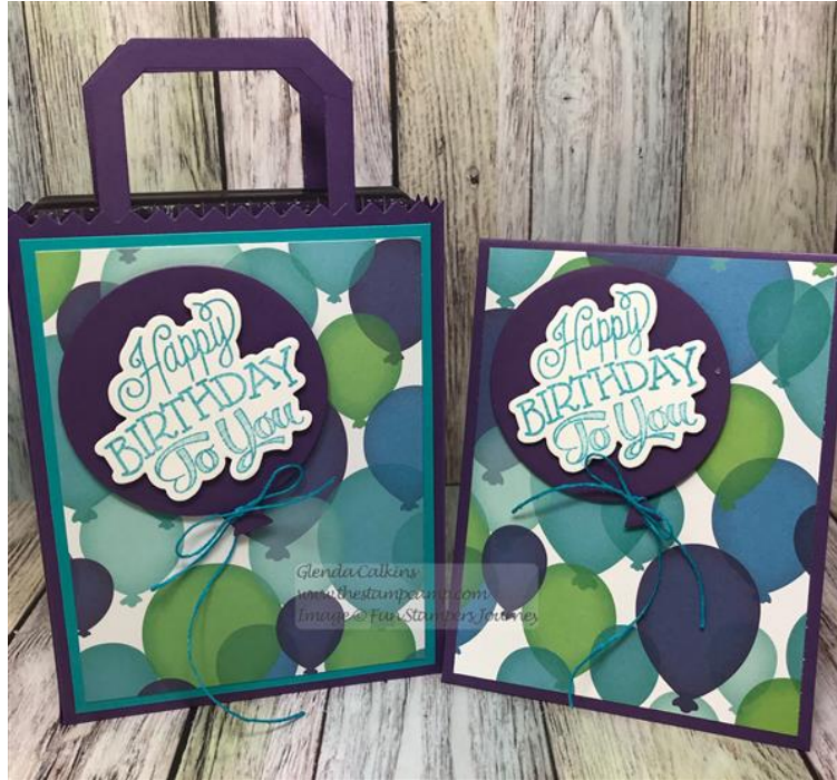
Card Carrier and Coordinating Card