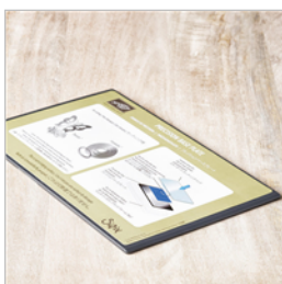
Precision Base Plate - 139684