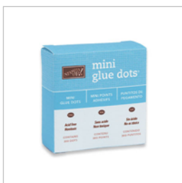
Mini Glue Dots - 103683