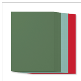
Christmas Around The World 8 1/2" X 11" Cardstock Pack* - 144630