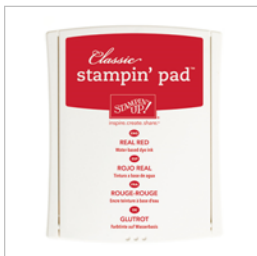
Real Red Classic Stampin' Pad - 126949