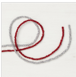
Mini Tinsel Trim Combo Pack* - 144636