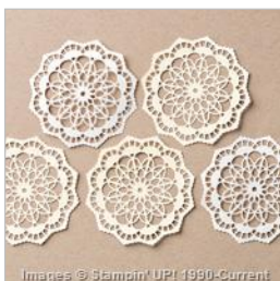
Lace Doilies - 142793