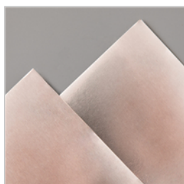
Champagne Foil Sheets - 144748