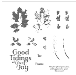
Good Tidings Photopolymer Stamp Set* - 144870