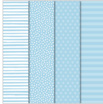
Subtles 6" X 6" (15.2 X 15.2 Cm) Designer Series Paper