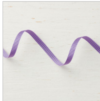
Gorgeous Grape 1/4" (6.4 Mm) Mini Striped Ribbon