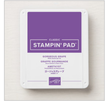
Gorgeous Grape Classic Stampin' Pad