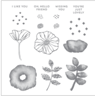
Oh So Eclectic Clear-Mount Stamp Set