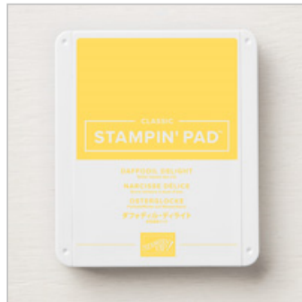
Daffodil Delight Classic Stampin' Pad