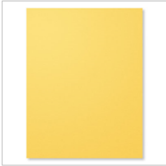
Daffodil Delight 8-1/2" X 11" Cardstock