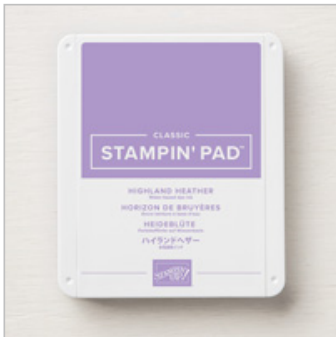
Highland Heather Classic Stampin' Pad