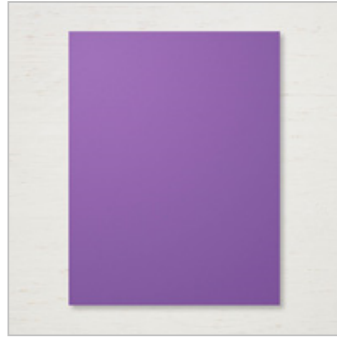
Gorgeous Grape 8-1/2" X 11" Cardstock