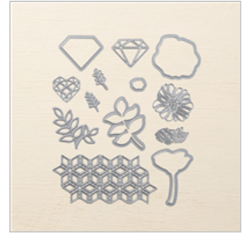
Eclectic Layers Thinlits Dies