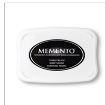
Tuxedo Black Memento Ink Pad