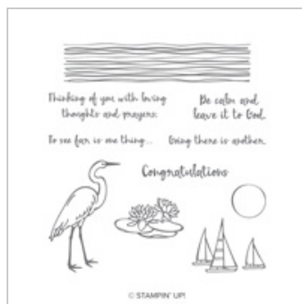
Lilypad Lake Clear-Mount Stamp Set