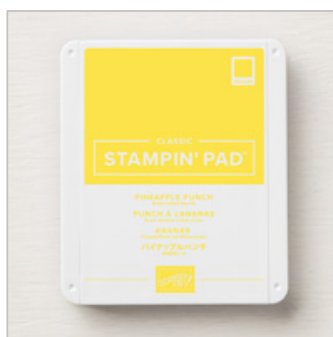
Pineapple Punch Classic Stampin' Pad