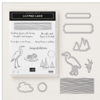
Lilypad Lake Clear-Mount Bundle