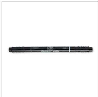
Basic Black Stampin' Write Marker