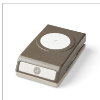
2" (5.1 Cm) Circle Punch