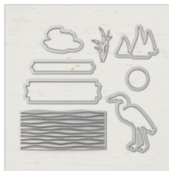
Lakeside Framelits Dies