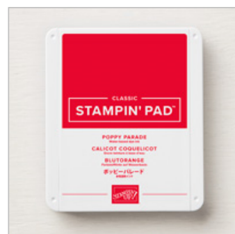
Poppy Parade Classic Stampin' Pad