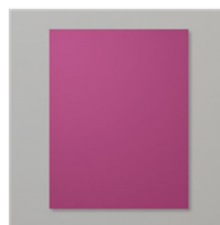
Rich Razzleberry 8-1/2" X 11" Cardstock - 115316