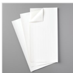
Adhesive Sheets - 152334