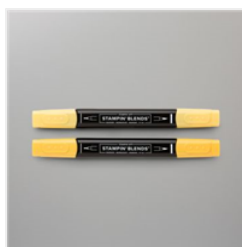
Daffodil Delight Stampin' Blends Combo Pack - 154883