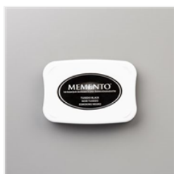
Tuxedo Black Memento Ink Pad - 132708