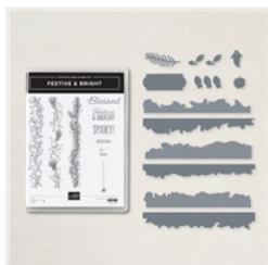
Festive & Bright Bundle - 156566