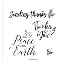
Thinking Thanks & Peace Cling Stamp Set (English) - 156552