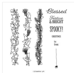
Festive & Bright Photopolymer Stamp Set - 158536