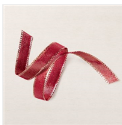
Cherry Cobbler & Gold 1/2" (1.3 Cm) Metallic Ribbon - 156312