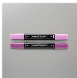
Blackberry Bliss Stampin' Blends Combo Pack - 154877