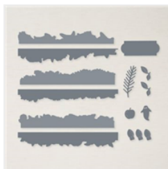
Festive Finishes Dies - 156565