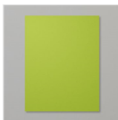
Granny Apple Green 8-1/2" X 11" Cardstock - 146990