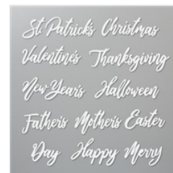
Word Wishes Dies (En) - 149629