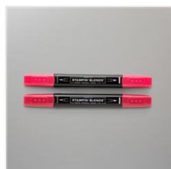
Real Red Stampin' Blends Combo Pack - 154899