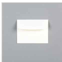
Very Vanilla Medium Envelopes - 107300