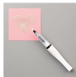
Wink Of Stella Clear Glitter Brush - 141897