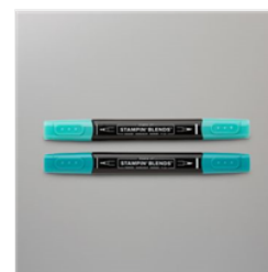
Bermuda Bay Stampin' Blends Combo Pack - 154878