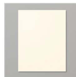
Very Vanilla 8-1/2" X 11" Cardstock - 101650