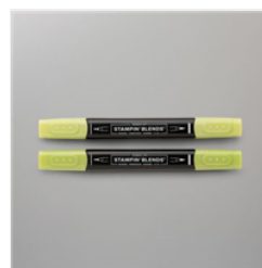
Granny Apple Green Stampin' Blends Combo Pack - 154885