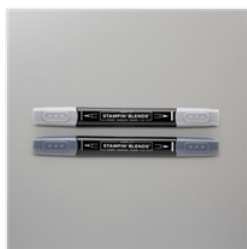
Basic Black Stampin' Blends Combo Pack - 154843