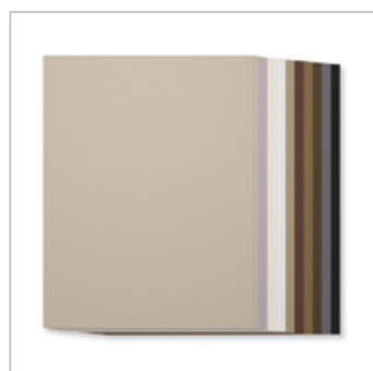
Neutrals 8-1/2" X 11" Cardstock