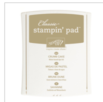
Crumb Cake Classic Stampin' Pad