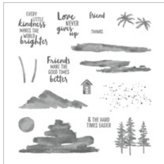
Waterfront Photopolymer Stamp Set 146386