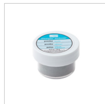
Silver Stampin' Emboss Powder