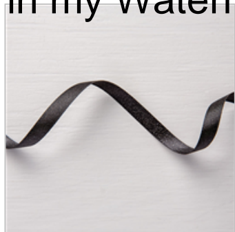
Basic Black 3/8" Shimmer Ribbon