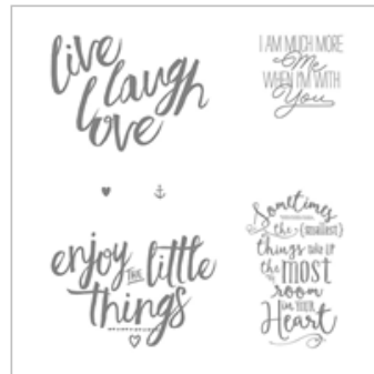
Layering Love Clear-Mount Stamp Set 141965