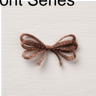
1/4" Copper Trim