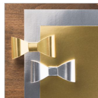
Silver Foil Sheets