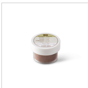
Copper Stampin' Emboss Powder