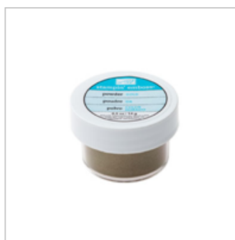
Gold Stampin' Emboss Powder