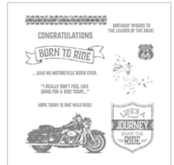
One Wild Ride Clear-Mount Stamp Set 141724