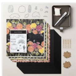
Rustic Harvest Suite Collection (English) - 159648

Tami White tami@stampwithtami.com www.stampwithtami.com