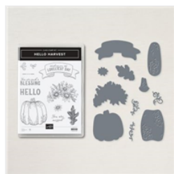
Hello Harvest Bundle (English) - 159644