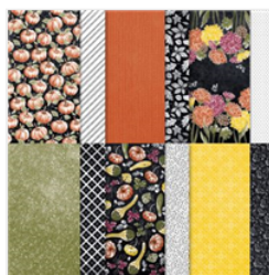
Rustic Harvest 12" X 12" (30.5 X 30.5 Cm) Designer Series Paper - 159633