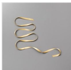
Gold 1/4" (6.4 Mm) Shimmer Ribbon - 152156