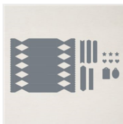
Cracker & Treat Box Dies - 159182