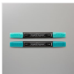
Bermuda Bay Stampin' Blends Combo Pack - 154878