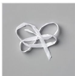
Whisper White 1/4" (6.4 Mm) Crinkled Seam Binding Ribbon - 151326