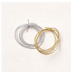
Simply Elegant Trim - 155766