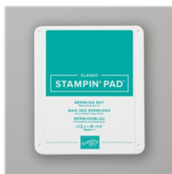
Bermuda Bay Classic Stampin' Pad - 147096