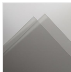
Window Sheets - 142314