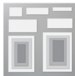
Rectangle Stitched Dies - 151820