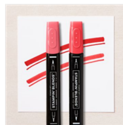
Sweet Sorbet Stampin' Blends Combo Pack - 159224