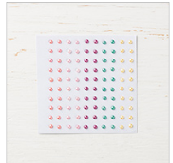
Share What You Love Artisan Pearls