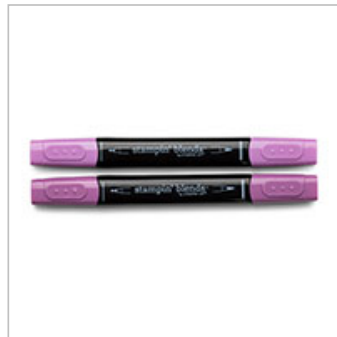
Rich Razzleberry Stampin' Blends Markers Combo Pack