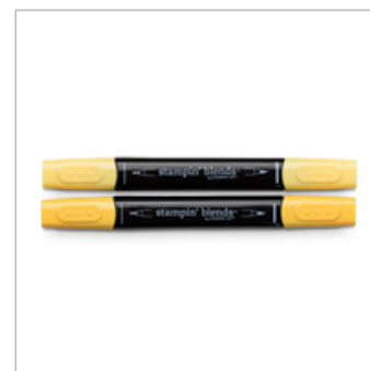
Lots Of Happy Card Kit