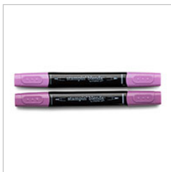
Rich Razzleberry Stampin' Blends Markers Combo Pack