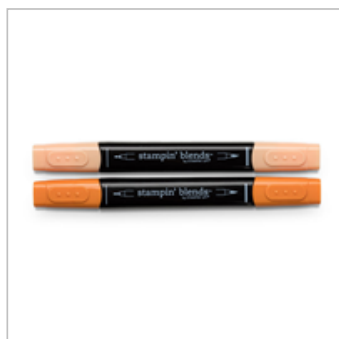
Pumpkin Pie Stampin' Blends Markers Combo Pack