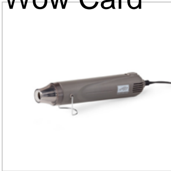
Heat Tool (Us And Canada)