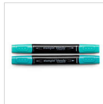
Bermuda Bay Stampin' Blends Markers Combo Pack