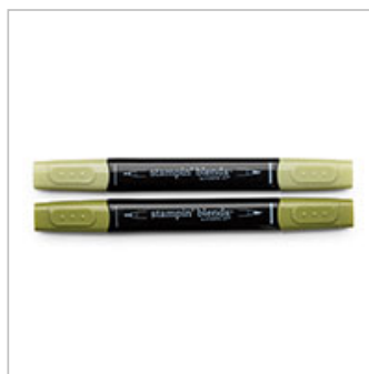
Old Olive Stampin' Blends Markers Combo Pack